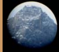
Digiscoping with a tripod and digital camera. HaLing image is 10x zoom at Right.