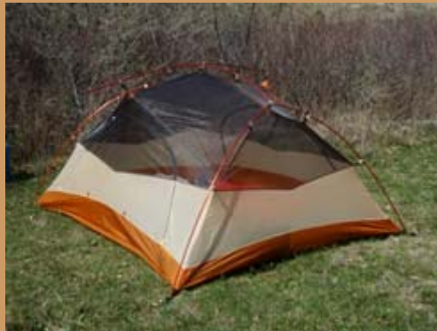
Copper Spur UL 3 person - tent body without fly

This year Yamnuska replaced many of our fleet of light-weight summer backpacking tents with the new Big Angus Copper Spur UL 3-person tents. After a season of use and abuse we are ready to give this new tent a big thumbs up! These tents provided reliable light weight and rain free shelter through a variety of conditions ranging from early spring thunder and hail storms to late summer snow squalls on some of the Canadian Rockies' most challenging backpacking routes.